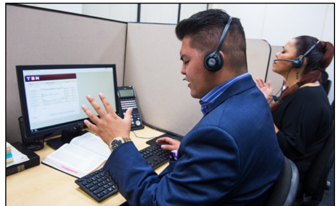
Over the past nearly forty-five years, TBN's prayer partners have led millions of individuals to faith in Christ, and prayed over the needs of countless millions more.