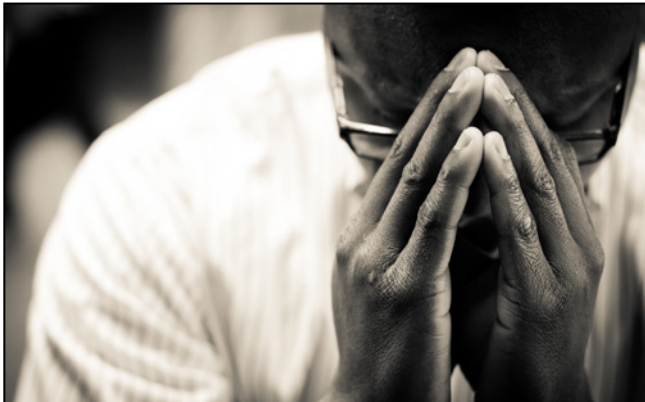
In the first three months of 2017, TBN's prayer partners took a total of 234,340 calls for prayer from viewers around the world.

1,695 calls from people with praise reports for answered prayer.