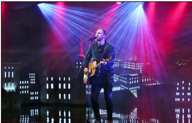
Heartfelt praise and worship has become a hallmark that draws viewers to TBN UK.