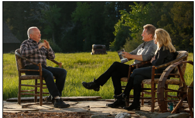
Author Wm. Paul Young hosts Restoring the Shack on TBN, based on his best-selling novel. Airs Sundays at 10 p.m. Eastern / 9 p.m. Central.

Restoring the Shack . Based on the bestselling novel The Shack and the big-screen movie of the same title, this series is helping millions find a true and meaningful relationship with Jesus — based on God's love and kindness alone.