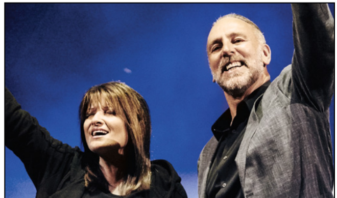
Pastors Brian and Bobbie Houston provide life-changing ministry on the Hillsong Channel.

In total, TBN's Hillsong Channel can be viewed by nearly 200 million people around the world.