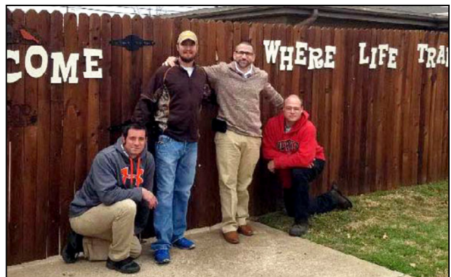
KDOR has done much to get the word out about the great outreach being done by Oklahoma Adult and Teen Challenge.

With six locations throughout the state, Oklahoma Teen Challenge continues with the outreach started over fifty years ago by David Wilkerson, to disciple and guide both young people and adults who have struggled with substance abuse and other life-controlling circumstances.