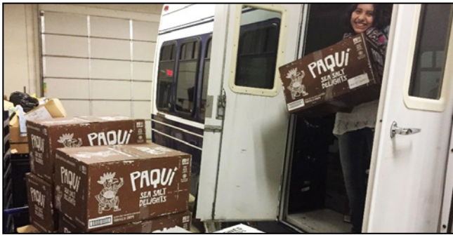
An area teen helps unload a truck filled with food donations for WCLJ's "His Hand Extended" outreach. Each month the Indianapolis TBN channel serves over 300 needy individuals and families throughout the community.

we have been able to impact many people and families for His kingdom.”