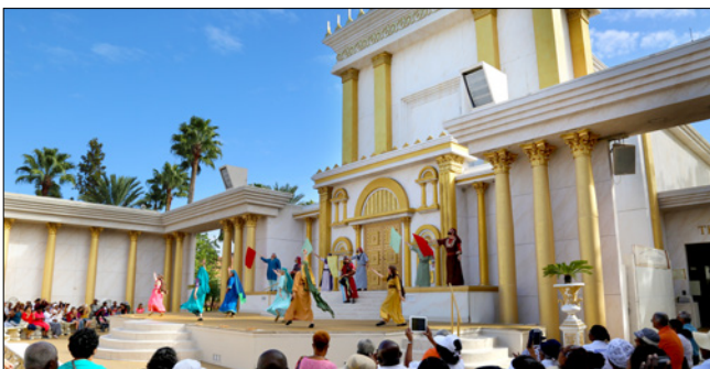
Guests enjoy an outdoor musical production at Holy Land Experience.