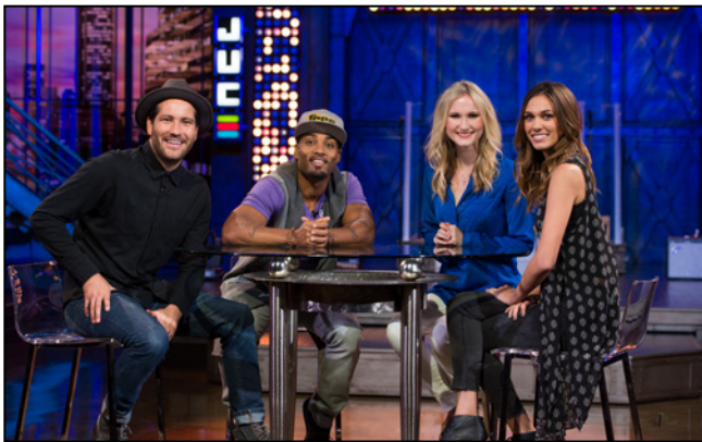
Teens and young adults consume a lot of media — and JUCE is there with life-changing content.

This has been an exciting quarter for JUCE, TBN's network specifically for teens and young adults. This group is often referred to as the "Millennial Generation" for those 20 years of age and older and "Generation Z" for those 19 years and under. Significantly, this age group represents over half the global population, and in North America Millennials now far outnumber Baby Boomers.