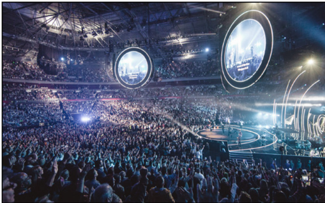
TBN has teamed with Hillsong for one of the most exciting new faith networks — the Hillsong Channel — featuring all the best in cutting-edge worship from gifted singers, songwriters, and musicians.

Launched in June 2016, TBN's Hillsong Channel is reaching a new generation of viewers with the message of hope and grace through cutting-edge worship, relevant teaching, and ministry from today's top Christian leaders.