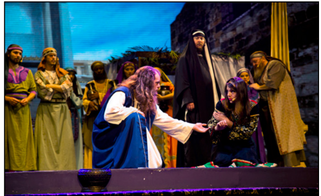
Jesus reaches out to a person in need in one of the Holy Land Experience's popular theatrical productions.

park’s popular outdoor Passion drama. Entitled His Story , the award-winning production returned to the streets of Holy Land Experience to offer guests an up-close and unforgettable reenactment of the suffering, death, and resurrection of Jesus Christ.