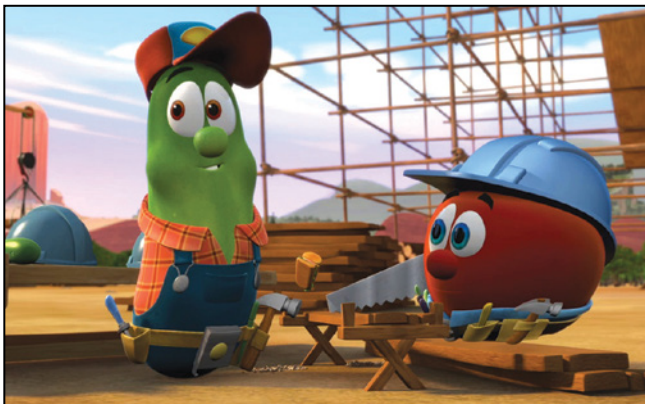
TBN and SMILE are the exclusive broadcasters for VeggieTales.

The first quarter of 2017 was a fruitful time for SMILE, TBN's 24-hour network for children ages two to twelve. According to research by George Barna, only six percent of adult Christians made a decision to follow God after the age of 18. That means 94 percent make that crucial step as children. This is why we are so excited about the outreach of our SMILE network. There is simply no better time than childhood for individuals to be led into a relationship with Jesus Christ and to be mentored for a lifetime of fruitfulness in His kingdom.